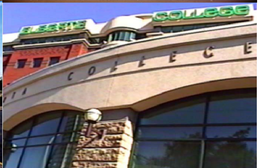
Alberta College Campus