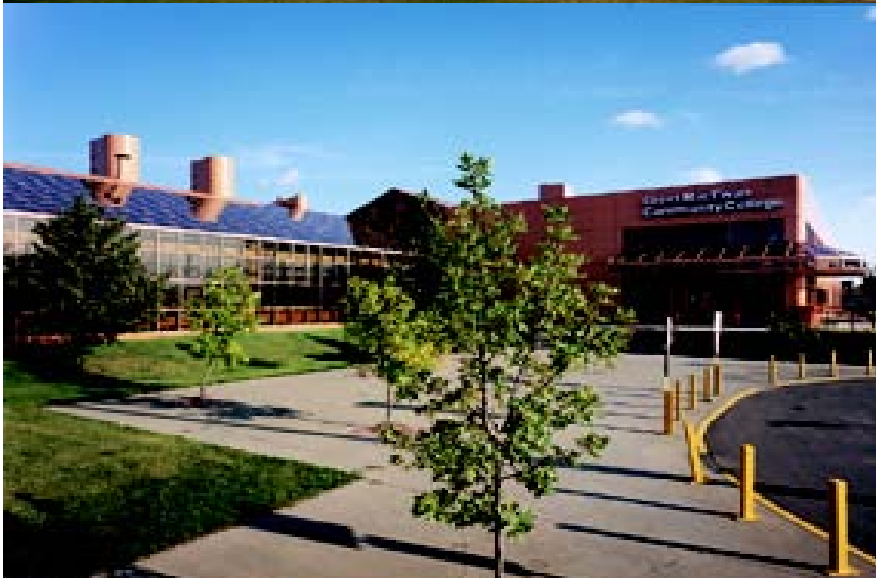
Centre for the Arts and Communications